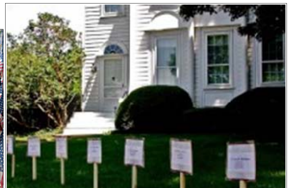
Places on the Field of Flags honoring the 52 fallen heroes from Connecticut.