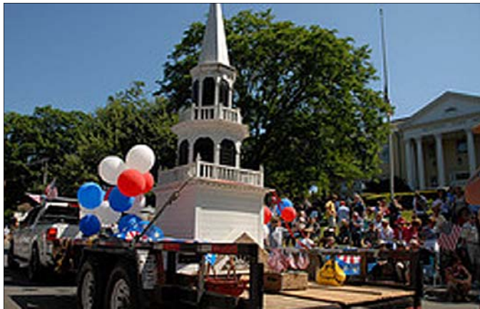
Saugatuck Church won first for the best Organization Float.